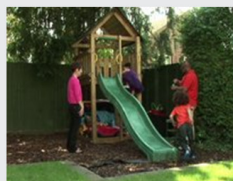
Sarah PACT Adopter

You can view all the videos at www.pactcharity.org/wall